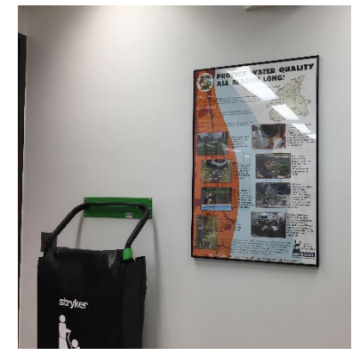
Fall poster displayed at the Oakland County Water Resources Commissioner's Office