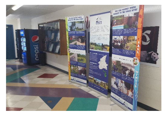
ARC's retractable banners displayed in Westland

To meet the activities in the Collaborative PEP, ARC staff designed 3 sets of 3 educational banners with varying messages that will meet the Collaborative PEP. Topics included: The connection of the MS4 to area waterbodies and the potential impacts discharges could have; the importance of pollution prevention and watershed restoration and stewardship; reporting illicit discharges; promoting proper disposal practices; identify and promote facilities for collection or disposal of household hazardous wastes; septic system maintenance; proper application and disposal of pesticides, herbicides, and fertilizers; proper disposal practices for grass clippings, leaf litter and animal;